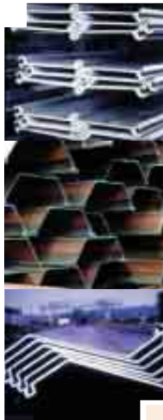
A sheet pile is a long steel section provided, on each of its edges, with interlocks by means of which it can be connected to another sheet pile to form a continuous wall. It is available in various forms: flat, Z or U profiles. It may be hot- or cold-rolled.

Sheet piling may be painted or trimmed with brick, wood, stone or vegetation. Its dimensions (up to more than 30 metres in height) and profile are tailored to the loading, the nature of the ground, the substance to be retained (soil, water, air...). The special expertise of Arcelor RPS lies in bespoke production in accordance with technical requirements. To this end, a team of engineers and technicians assists design engineers in the choice of the best solution (preliminary design, advice on deployment...).