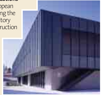
Construction products will soon be subject to the same environmental and sanitary requirements throughout Europe. The CEN (European Committee for Standardization) is working to this end.