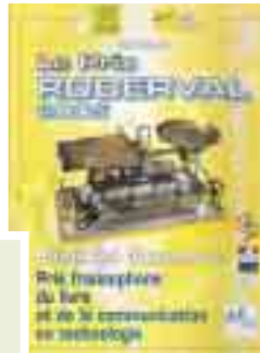
The Roberval prize was founded in 1986 by Compiègne University of Technology.

Out of 355 entries this year (a record), 22 were shortlisted. The Otua CD-ROM was one of four shortlisted in the multimedia category. Awarded annually since its creation in 1986, this prize affords recognition to publications devoted to the presentation of technological knowledge to the layman in four categories: general public, higher education, television, multimedia. More than 200 experts from the world of industry, universities and scientific communication conduct an in-depth examination of each of the submitted works. Any technical inaccuracy is sufficient to reject an entry. For the works selected, shortlisting for this prize is therefore evidence of outstanding quality and attention to detail. For further information: http://prixroberval.utc.fr/