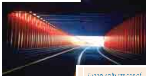
Tunnel walls are one of the land-based applications of sheet piling.