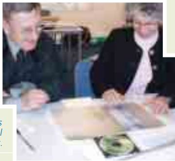
From the 98 projects submitted, a technical committee shortlisted 15.

The competition launched by Otua on the use of steel in interior design met with great success. More than 300 applications received and 98 actual entries, from which a technical committee consisting of journalists, interior designers and Otua members selected 15 projects in November 2005. The shortlisted candidates will present their project at the Paris Furniture Fair, where the awards ceremony will take place on 6 January 2006.